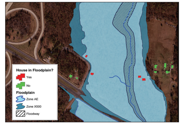
Sample of Digital Flood Hazard Data

FEMA exercises great care to ensure that the analytical methods used for its engineering studies are scientifically and technically correct. FEMA also uses the best available technologies to ensure that the maps depict accurate flood risks.